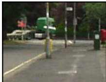
"CONSTRUCTION TRAFFIC NO RIGHT TURN"

If the majority of lorry drivers totally ignore this sign and turn right onto Dumbreck Road in order to shorten their journey? "its bad enough that McAlpine are allowing deliveries to the site to take place at 7.30 in the morning when the letter they sent to every tenant states that no such deliveries will take place before 9.30? " But when a complaint is made to the site manager (by a number of tenants), the blame is placed elsewhere on a security guard or a lorry driver and it seems responsibility for these problems are not McAlpine's. From now on then, your tenants association will endeavor to take photo and video evidence to present to McAlpine via our website and Newsletter of course.